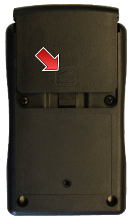
Fig.TachoReader Combo - battery change.