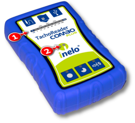
Fig. TachoReader Combo - main operating elements.

1. Description of the ports used to connect the device to the computer, tachograph: