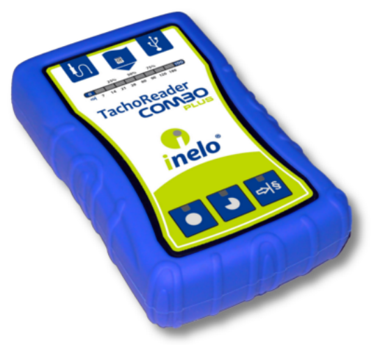
Fig. TachoReader Combo Plus.

TachoReader Combo Plus device allows to download data directly from a tachograph or a driver's card, without having to connect other devices. What is more, the device makes it possible to store data in its internal memory until the data is transferred to a different data carrier (e.g. a computer disk).