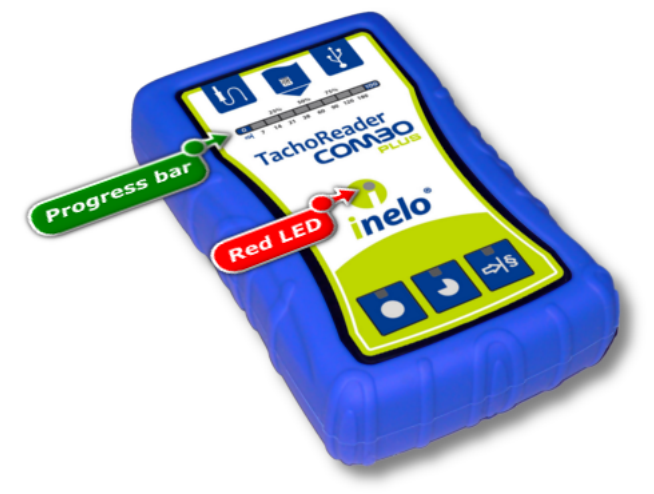
Fig. TachoReader Combo - indication elements.

Press the respective button. A running download process is indicated by flashing of the red LED on the device foreside and by the expanding progress bar.