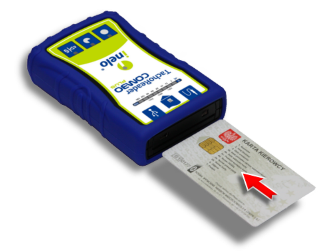
Fig. TachoReader Combo Plus - inserting a driver card.

If during data retrieval red LED located in the center of the label lights up for about 4 seconds, and in this time the device sounds three short beeps, then it goes off for about 2 seconds (repeatedly), this means an error occurred - refer to the "<u>Error codes</u> 21" topic.